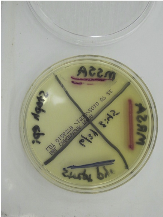
Control plate. This is available in color online at www.jopan.org .